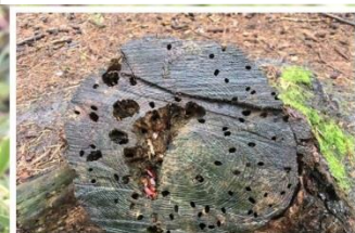
Holes in Wood