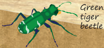
Green tiger beetle